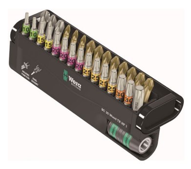
The 30-piece Bit-Check 30 Wood TX HF.