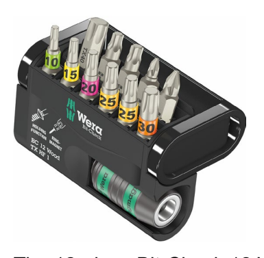
The 12-piece Bit-Check 12 Wood TX HF.